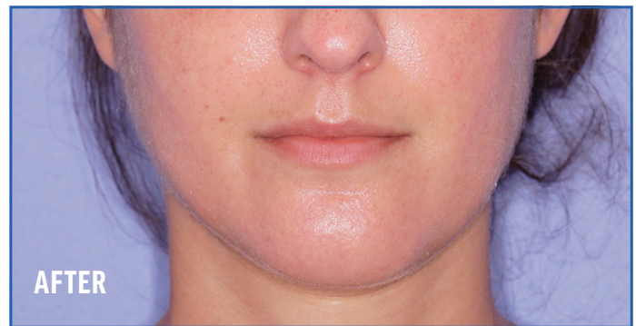
Patients are shown before (left) and after one treatment.

“When treating patients with BBL HERO plus MOXI, we start with 400 to 600 pulses of BBL HERO to cover the face, followed by an immediate transition to MOXI,” Dr. Ibrahim says. MOXI safely addresses deeper pigments than BBL, including for melasma, he explains.